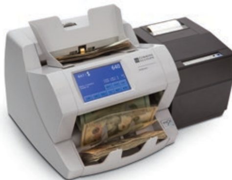
Shown with optional impact printer

Power: 105-130 VAC or 198-253 VAC, 50/60 Hz.