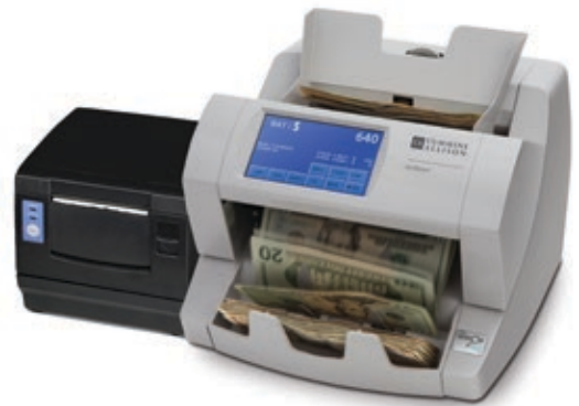
Shown with optional thermal printer